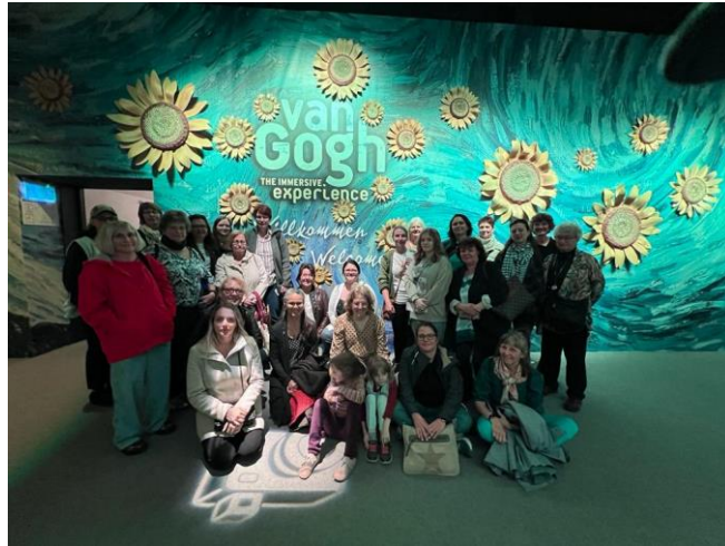
Ladies of the DON during the Ladies Event at the Emirat Shrine Spring Ceremonial

On Saturday, 13 May 2023, we started our lovely ladies' program at 10:30 at the hotel and went to the "Van Gogh Experience" in Ludwigsburg, everyone enjoyed this amazing exhibition. After this we had a nice lunch and could chat about it, the Shriners and discussed information about the Daughters of the Nile.