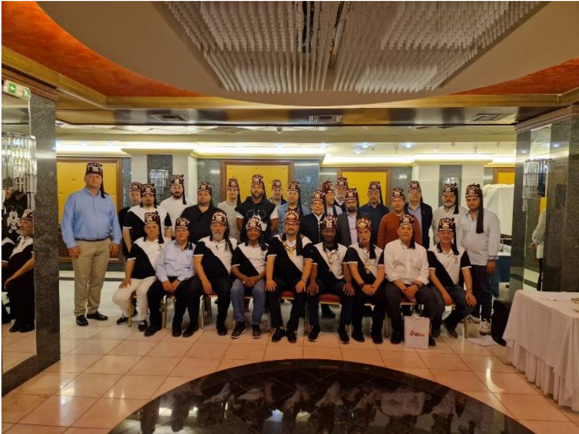
Nobles and DIVAN after creation in Greece.