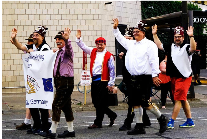
Emirat Shriners from Germany during the 2022 Imperial Session Parade in Minneapolis, MN.