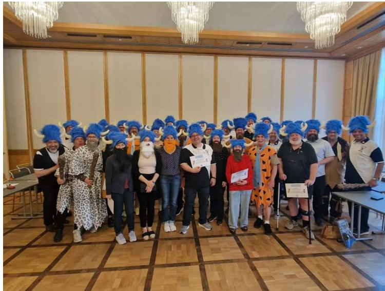
Pictured above the first creations of many to come of the Loyal Order of Water Buffaloes, Quarry 194