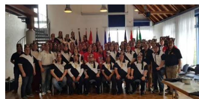
2019 Fall Ceremonial in St Leon-Rot