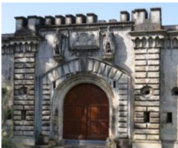
Entrance to the Lodge building in Ingolstadt where the founding meeting was held

the entry to the parking lot). The meeting was held and the attendees all voted unanimously for starting the “BAVARIAN SHRINE CLUB” located in Ingolstadt. This event was so important, that even demitted Nobles showed up and consider seriously coming back!