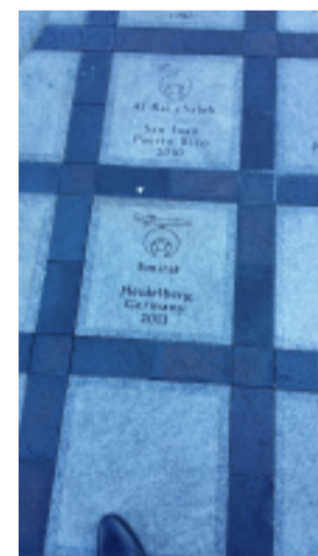
The Emirat Stone in front of Shriners International Headquarters