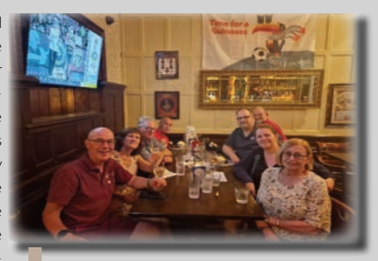
Pictured: Emirat's Potentates Night out with the Representatives and Ladies.

The two biggest votes, were per capita and the budget. When the budget was first present it had a deficient of 1.2 million dollars and they did not know where they were going to get the money to cover it. It had been reported earlier that we had to sell off a quarter of our assets just to pay our bills this year. The budget for 2024 did not look any better if something was not done to fix it.